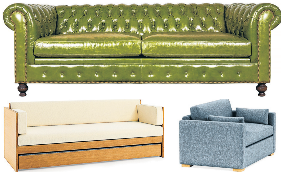
WHAT HAVE YOU GOT TO HIDE? From top: Clam Sleeper, from $5,625, ligne-roset.com ; Higgins Traditional Chesterfield Sleeper, from $3,149 for queen, rogerandchris.com ; Hans Wegner GE261 Sofa Bed, from $6,341, danishdesignstore.com ; Charly Twin Sofa, from $1,895, interiordefine.com .

Not all convertible sofas require you to toss seat cushions aside and